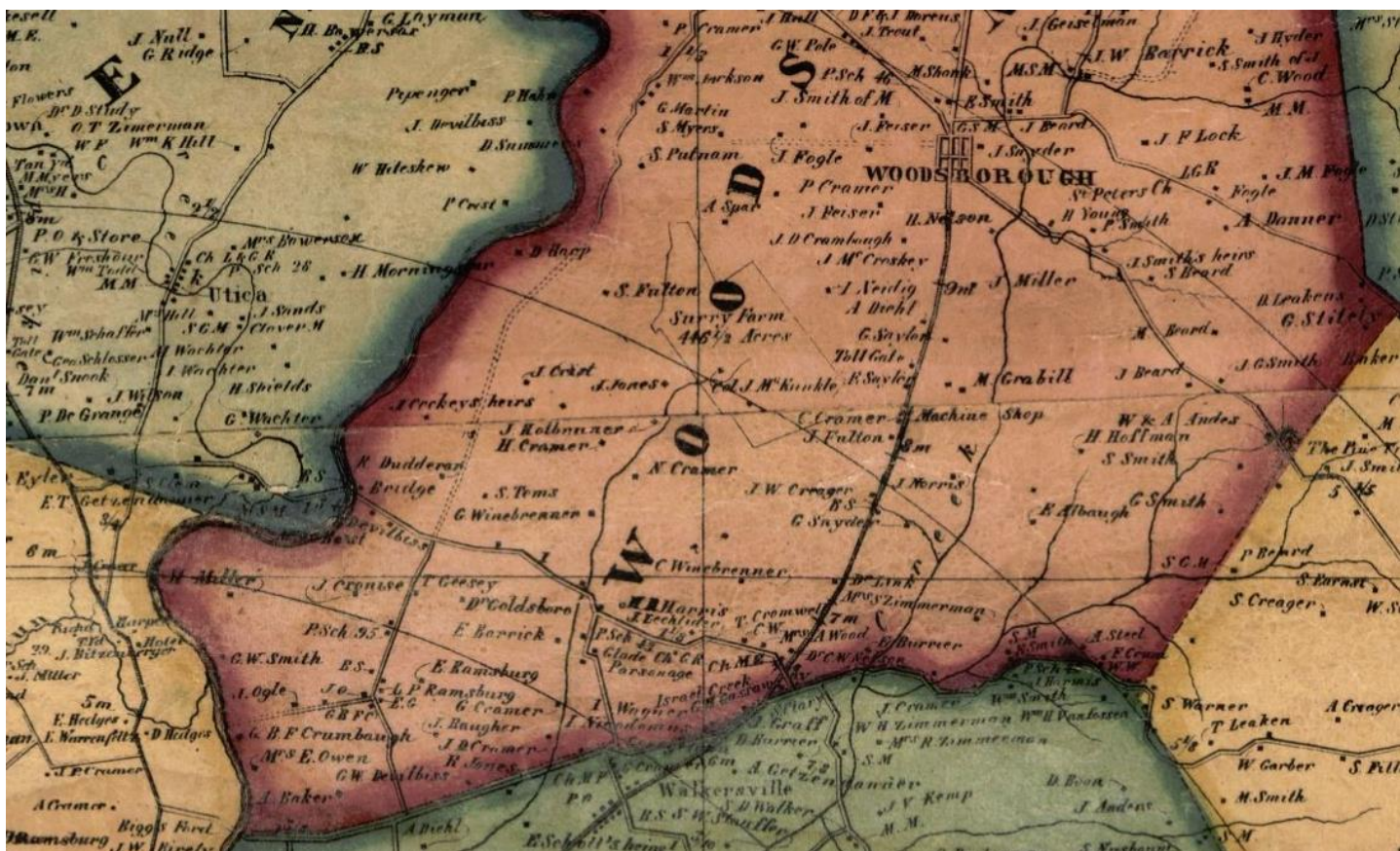
Woodsboro District No. 11